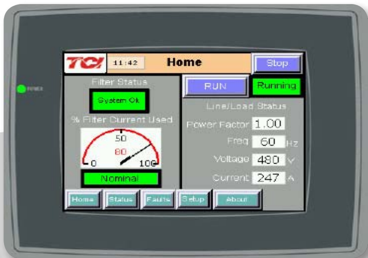
Large, 65K Color HMI

A large, built-in, 65 k color touchscreen HMI display with LED backlight is included, along with the communication options of Modbus RTU over RS485, Modbus TCP/IP, EtherNet/IP, HGA-HMI and DeviceNet.