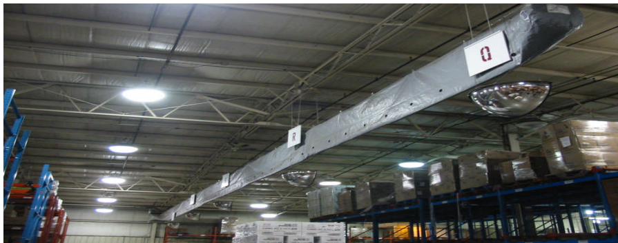
System off Single Suspension

New for 2012 - New Halo Tension suspension system (HTS) gives the appearance of your FlowCon diffuser system to be inflated when the air handling system is off. This option can be used with a simple one row cable suspension or single HD rail to keep the FlowCon diffuser looking inflated without airflow. Limited from 10" to 36" diameter, this option is perfect for applications where deflated diffuser hang down is a problem. Sections can easily be taken down and washed with no extra labor. Components include standard one row tension cable or our HD single rail system.