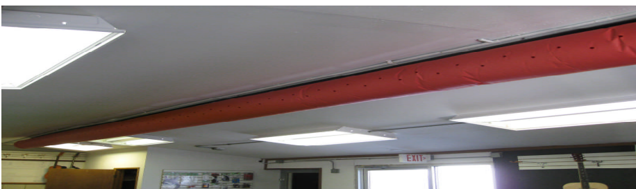
System off HALO Suspension