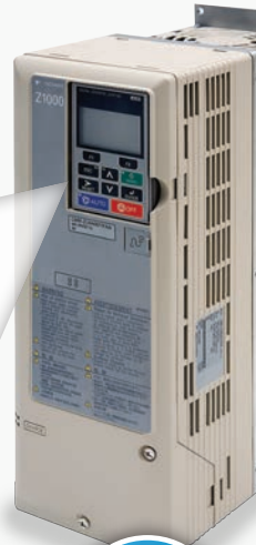
Standard Z1000 Drive