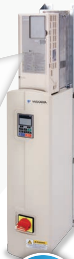
Z1000 Drive in an Intelligent Bypass Configuration