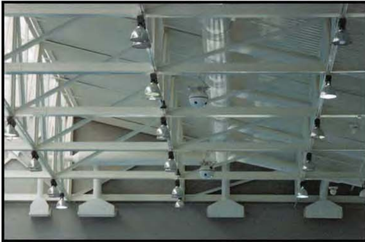
... or accent the architectural features of the space.