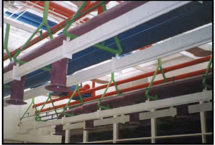
Spiral duct and fittings can either blend into their surroundings...

Over the past few years round and flat-oval spiral duct has become a major element of architectural design. The aesthetically pleasing round and flat-oval shapes enhanced by the spiral lockseam help to transform standard ventilation ductwork into a unique and integral design element used by more and more architects every day.