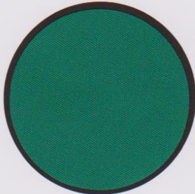
DK. GREEN 714