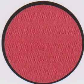
RED 717 Special order only