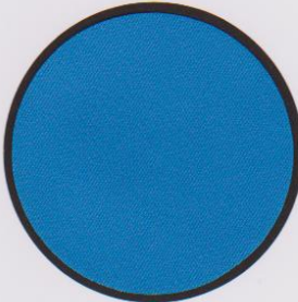
MED. BLUE 715